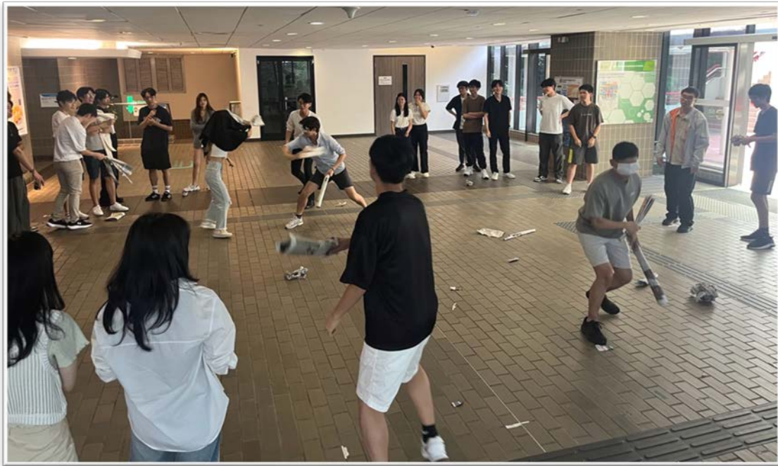
Freshmen playing ice-breaking game

The day began with ice-breaking games that quickly turned strangers into friends. These activities were thoughtfully crafted to help the freshmen feel at ease, encouraging them to step out of their comfort zones and start forming bonds that will last throughout their university years. The spirit of camaraderie continued with mass games, where teamwork and collaboration were key, further strengthening the group dynamics.